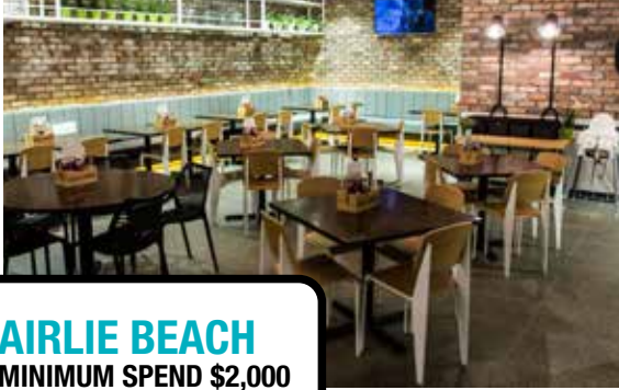
AIRLIE BEACH MINIMUM SPEND $2,000