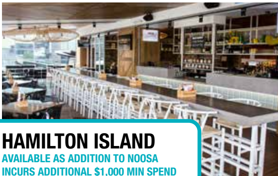
HAMILTON ISLAND AVAILABLE AS ADDITION TO NOOSA INCURS ADDITIONAL $1,000 MIN SPEND