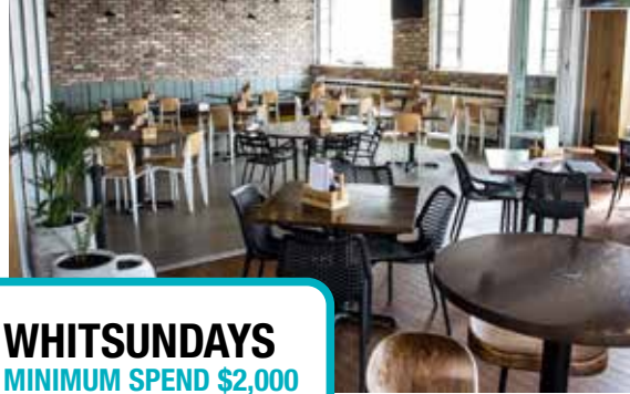
WHITSUNDAYS MINIMUM SPEND $2,000