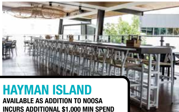
HAYMAN ISLAND AVAILABLE AS ADDITION TO NOOSA INCURS ADDITIONAL $1,000 MIN SPEND