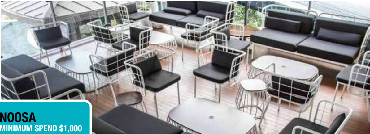
NOOSA MINIMUM SPEND $1,000